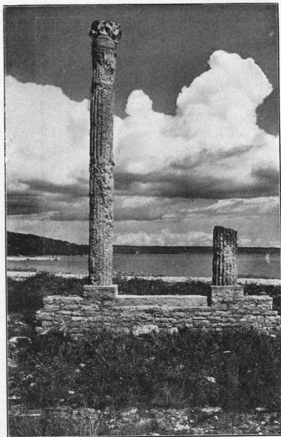
BRIONI - ROMAN REMAINS.

semble that it would be difficult to find its equal.