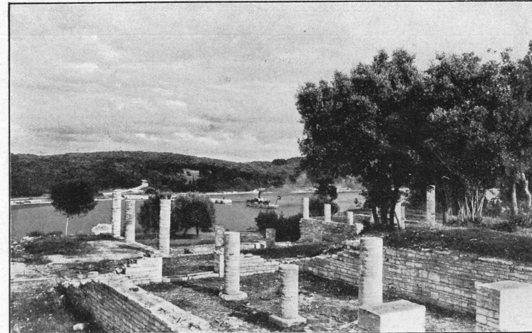
BRIONI - ROMAN VILLA.