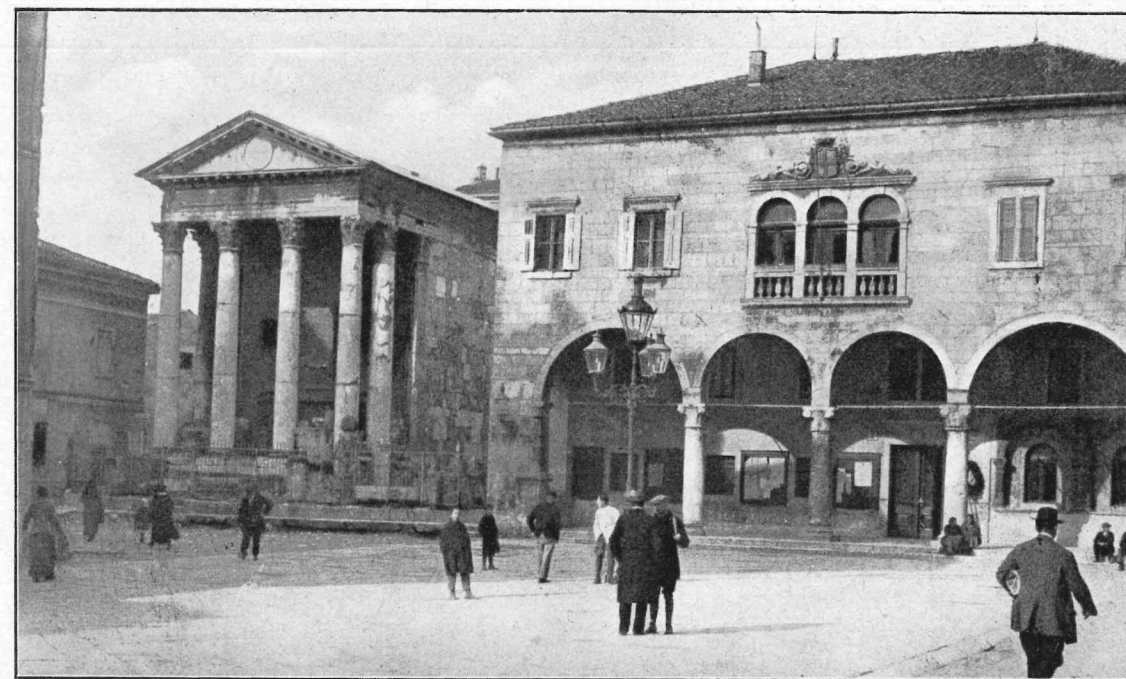
POLA - TEMPLE OF AUGUSTUS AND TOWN HALL ON THE FORUM.

From 27 B. C. Pola was perhaps the chief place of the province: it was a city of about 20,000 inhabitants, and was surrounded by a vast territory comprising the present communes of Dignano and of Valle, and sought from the sea, the springs of its vitality its functions and its importance. And while Aquileia centered in its emporium the commerce of upper Adriatic, Pola well-situated on the route of Salone, and the highways by sea to Constantinople, Illyricum, Noricum and Dacia and Pannonia, was a stopping place necessary for the transmarine traffic between Rome and the Orient. And Pola had the same importance during the Byzantine period. The new Kingdom of Italy with Ravenna as its capital, initiated a glorious period in the