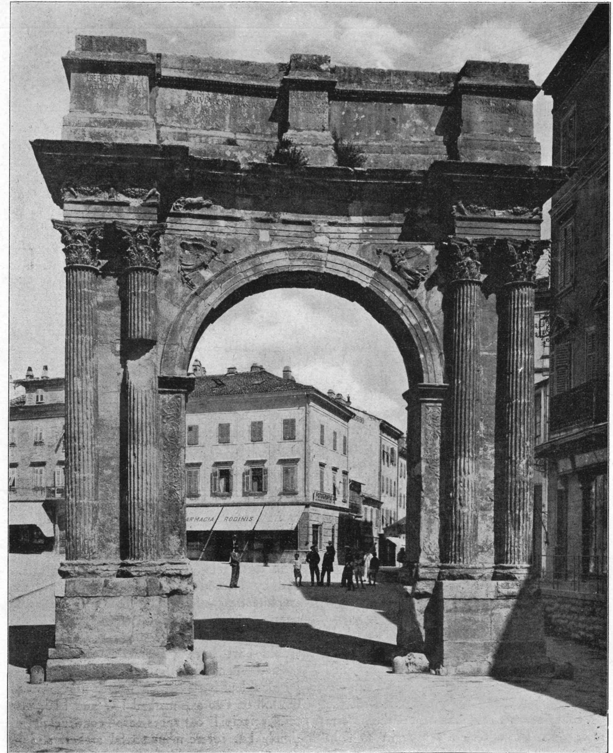
POLA - THE ARCH OF THE SERGII OR PORTA AUREA.

Besides the plan of the Roman city which remains integral, there are three of the principal monuments that Rome has launched in